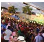
Winter Party Festival Feb/Mar

For exact dates, websites and additional information, please go to VisitMiamiLGBTQ.com