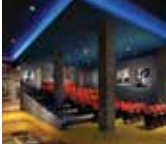
Sizzle Miami May