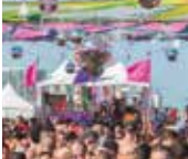
Miami Beach Pride Apr