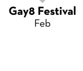
Gay8 Festival Feb