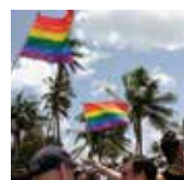
White Party Nov