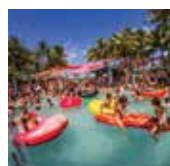
Celebrate Orgullo Oct