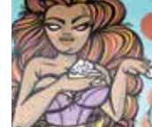
Hialeah Pride Oct