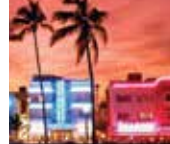
Aqua Girl Sep/Oct