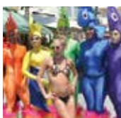
OUTshine Film Festival Apr